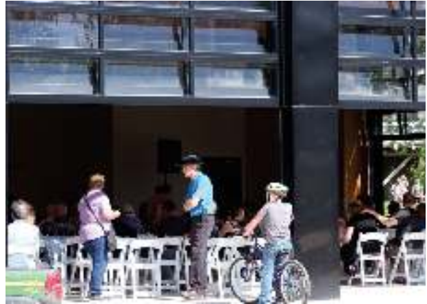
The Summer Pavilion on Canada Day.

We have held off on a few remaining projects because a certain government grant which we normally use for such projects has not yet been made available to us. Our Foundations for a Strong Future campaign has been instrumental in allowing us to undertake the projects we have completed thus far, but that campaign is not yet done. We still need to raise just under $900,000 to meet our $3,000,000 goal. We continue to invite supporters to consider a 2017 donation toward the campaign, over and above their normal donation to our operating fund. Contributions can be made by mail, in person, or on our website at www.mhv.ca .