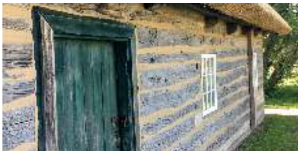
The west side of the house. Notice how thick the layer of reeds is.

The thatchers finished up just after Canada Day. Now that we've cleaned the interior and put all of the furniture back, the Waldheim House is open for visitors once more. Come visit, and see the results of the restoration for yourself!