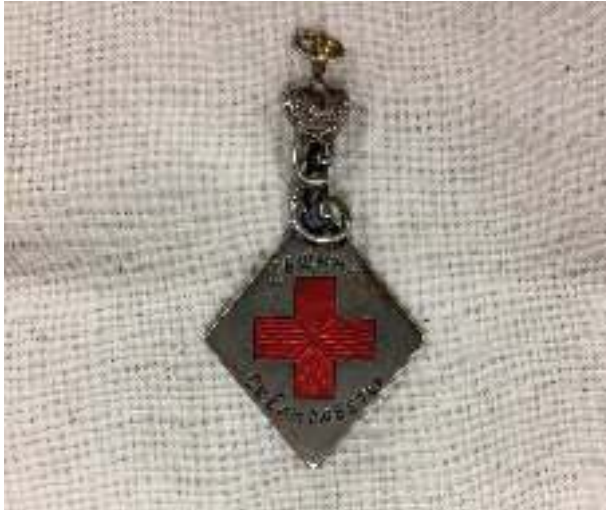
The front of the CO medal. The writing on the front reads "S.V. Elisaveta's Association."