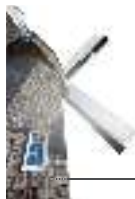
EXHIBIT: STORIED PLACES

Events and dates subject to change without notice. Visit www.mhv.ca for current event information.