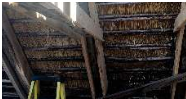
View of the underside of the roof in the attic as thatching is in progress.

Because there is nothing underneath the thatching but the roof itself, you can see the reeds from below. Visitors can now see them too; Walls that Speak installed a "skylight" in the ceiling through which visitors can see the underside of the roof.