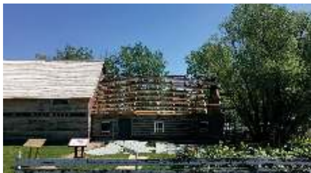
The Waldheim House without its sheet metal roof covered in moss.

As we wrote in our last article, the Waldheim House roof had deteriorated over the years, leading to issues with rot and mold. Walls that Speak fixed the structural issues caused by excess moisture, and a new thatched roof makes sure that these do not recur.