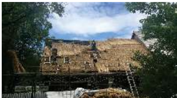
Thatching the east side of the house.

Walls that Speak scraped off the moss and removed the old roof. Before thatching began, we had an engineer assess whether the house could take the weight of the reeds. The historic rafters had to be reinforced, but that was all; as the house was probably thatched just after it was built, it was no surprise that it is sturdy enough.