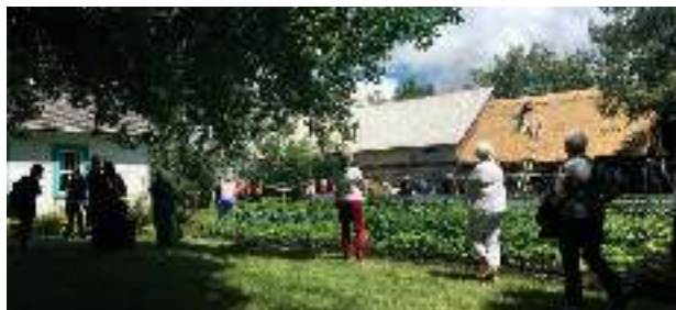
I wasn't the only one to find thatching interesting, not by a long shot. Here are visitors watching the thatchers put on the finishing touches during Canada Day.