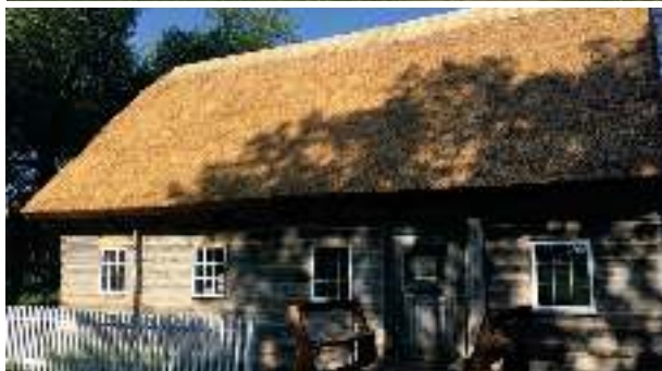
The Waldheim House, before and after. What a difference!

The Waldheim House restoration project was generously funded by the Canada 150 Community Infrastructure program, Steinbach Credit Union, the Thomas Sill Foundation, R.M. of Hanover, and private donors.