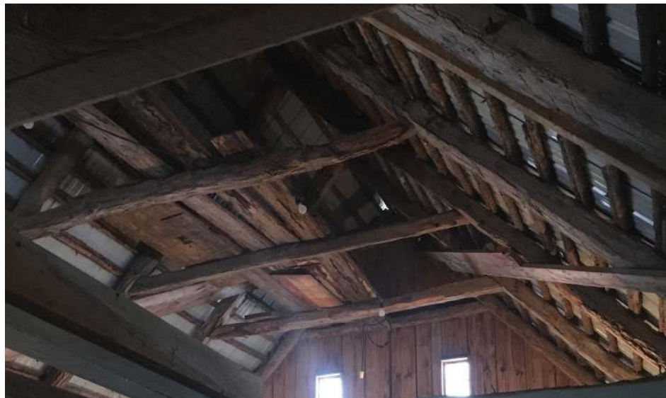
The Waldheim House as an open concept loft.

Like any other renovation, sometimes the unexpected happens. In this case, we found out that the ceiling boards were rotten and needed to be replaced. The ceiling was removed and, for a very brief period, the Waldheim House boasted a trendy open-concept loft while we waited for the ceiling to be replaced.