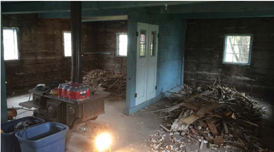
Piles of lath and plaster, torn down from the inside walls.

Over the years, the repeated exposure of the logs to the elements resulted in moisture doing its damage in the log walls and into the inside of the building.