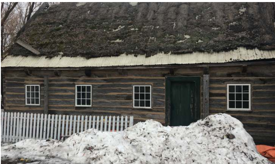
New windows were installed just in time for the first major melt of the spring.

New windows were also installed, just in time for the spring melt.