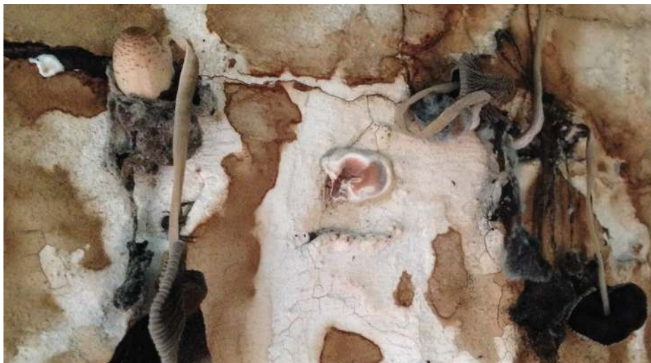
A close-up of the fungus collection that was growing out of the plaster on the bedroom wall.

Before this project began, the Waldheim House had quite a few problems with moisture getting inside. The house smelled strongly of mildew, there were mold spots on the woodwork throughout, and there was a patch of fungus growing out of plaster on the west wall that looked a bit like a science experiment.