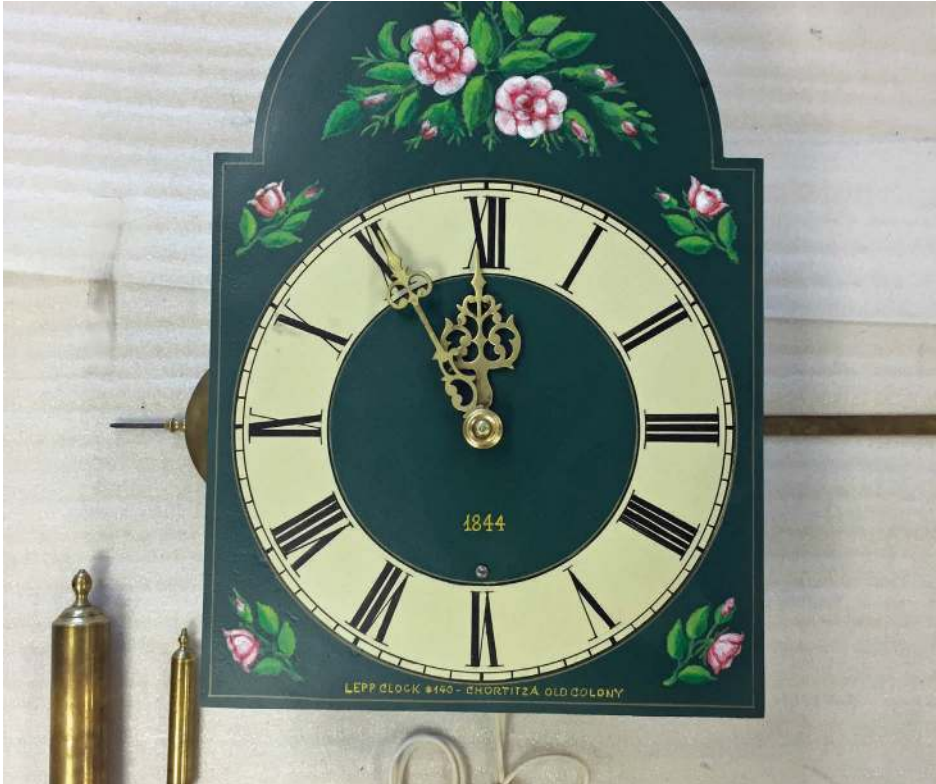
Our newest Lepp clock, the first donation of the year. Acc. no. 2017.1.1.