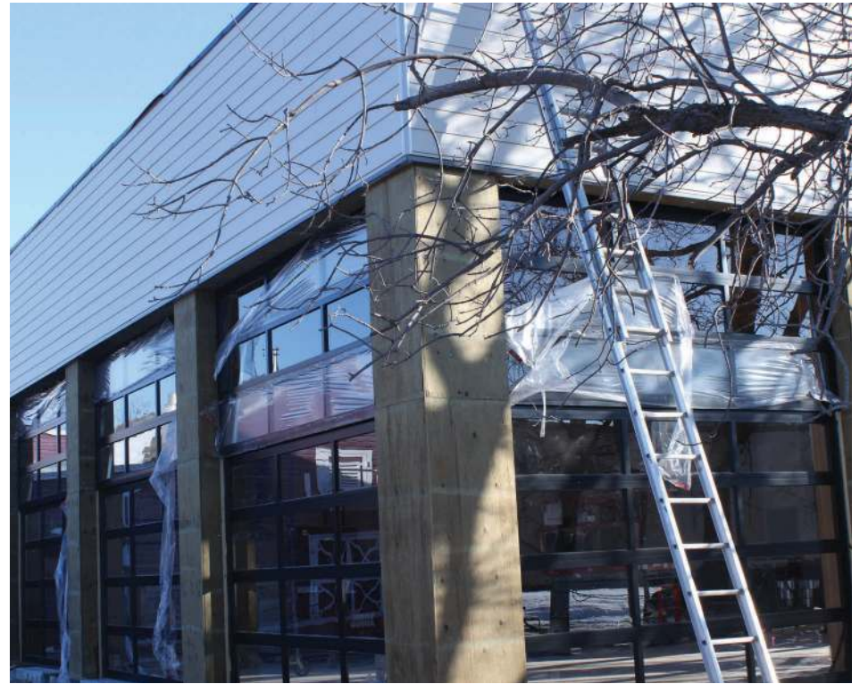
Summer Pavilion at MHV

will always be large projects. How nice it would be if we had individuals or groups who would adopt these buildings and provide ongoing care and funding for their preservation.