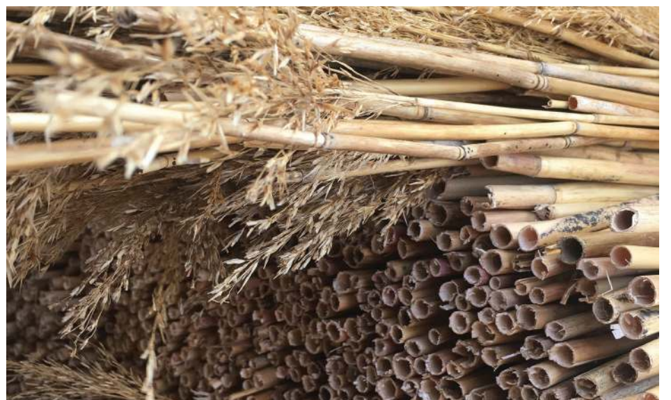
Phragmites reed, the material that will become our thatched roof.

Thatching is slated to begin mid-June and will take about 3-4 weeks. We invite you to come see this once-in-a-lifetime historical demonstration!