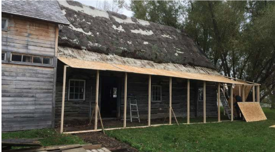
Waldheim House, prepped to begin structural repairs to the log walls.

If you wandered through the village over the fall and winter, you will have noticed the Waldheim House looking a little strange, as it underwent a major restoration.