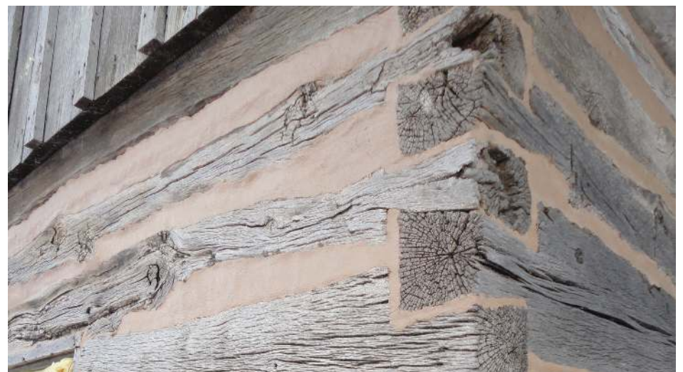
New chinking will provide much-needed protection from the elements.