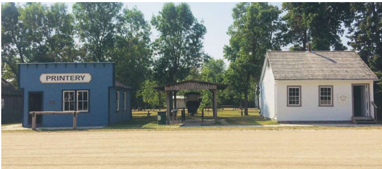
New coat of paint for Printery and Reimer store.

This summer two buildings in the village received a facelift! The Printery and the Reimer store got a new coat of paint and are looking very fresh. Thanks to our volunteer Bernie Hiebert for doing such an excellent job. We rely on volunteers and donations to keep our buildings in good repair and looking sharp year after year.