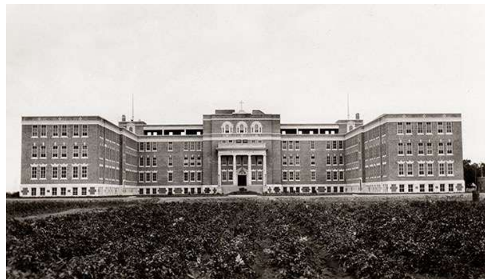
St. Boniface Sanatorium, date unknown